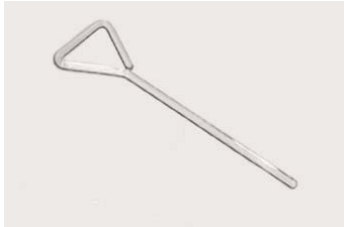
Inoculating hook made of glass (Drigalski-hook)