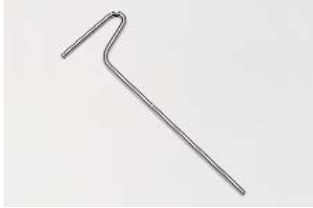
Inoculating hook made of stainless steel (Drigalski-hook)