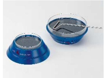
schuett petritum-M with inoculating hook (optional)

Useable on both sides, that means two work spaces in one device by easiest turn-over. For Petri dishes with Ø 100 and Ø 150 mm diameter.