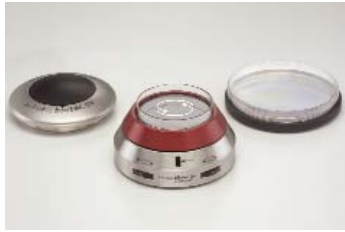
schuett petritum-E with foot-switch and turntable-attachment for Petri dishes up to Ø 150 mm (optional)